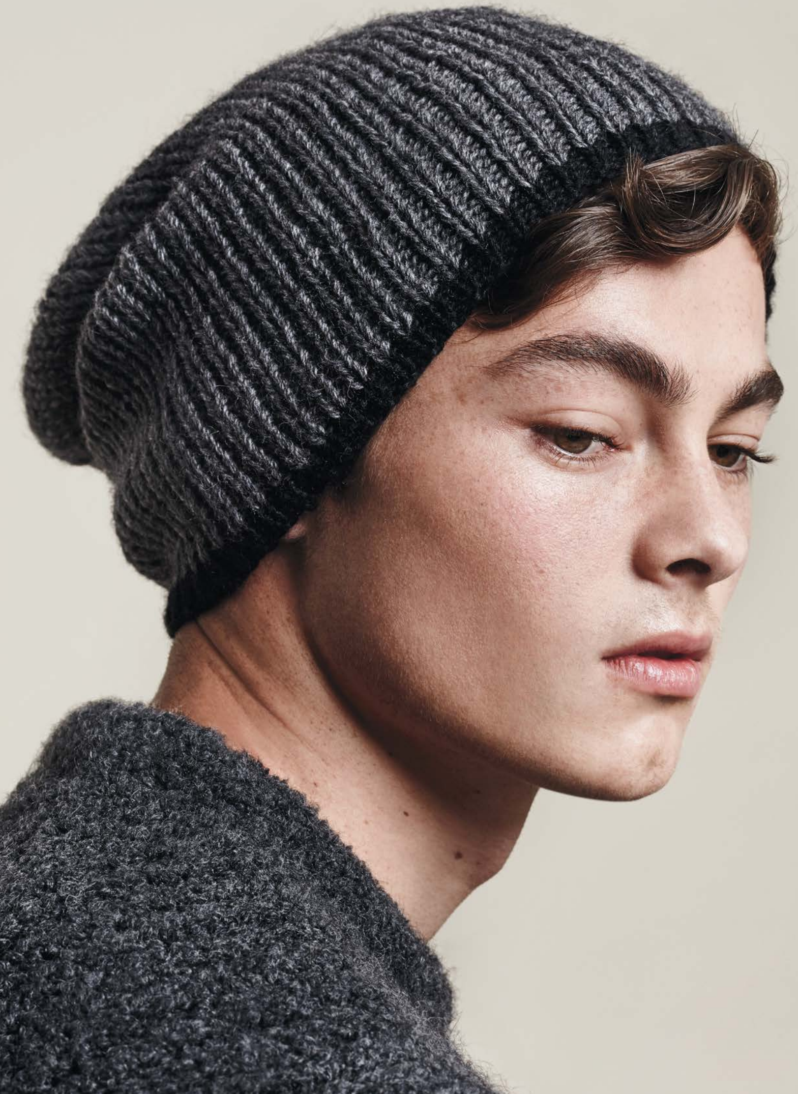
Left — Luz Beanie in Charcoal Multi. Right — Majo Toque in Soft Grey.