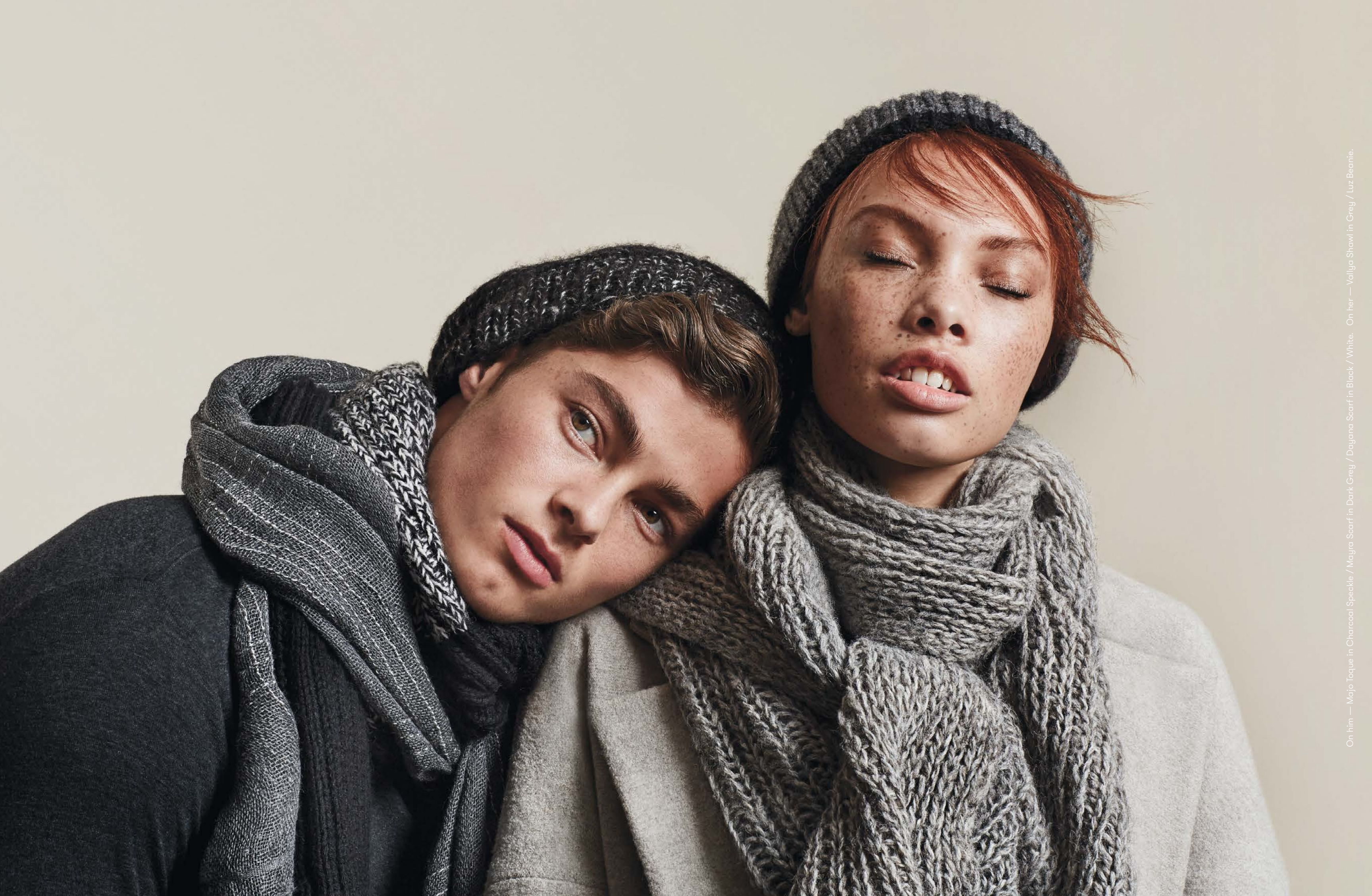
On him — Mojo Toque in Charcoal Speckle / Mayra Scarf in Dark Grey / Dayana Scarf in Black / White. On her — Vallya Shawl in Grey / Luz Beanie