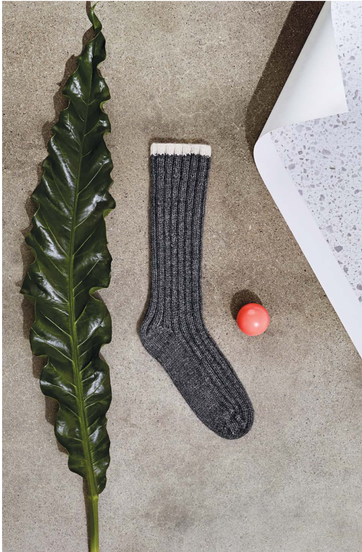
Luna Rib Knit Socks Dark Grey / White.

Every item that makes it from our place to yours gets us one step closer to building a stronger, more independent community for artisans in Puno. We're getting warmer.